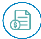
The Income Statement