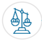
The Balance Sheet