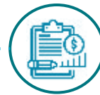
The Cash Flow Statement